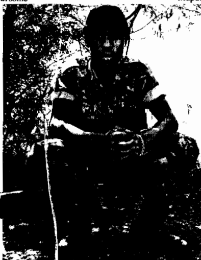
Unusual companion ... this member of the special unit calls himself 'Lucky Dube'