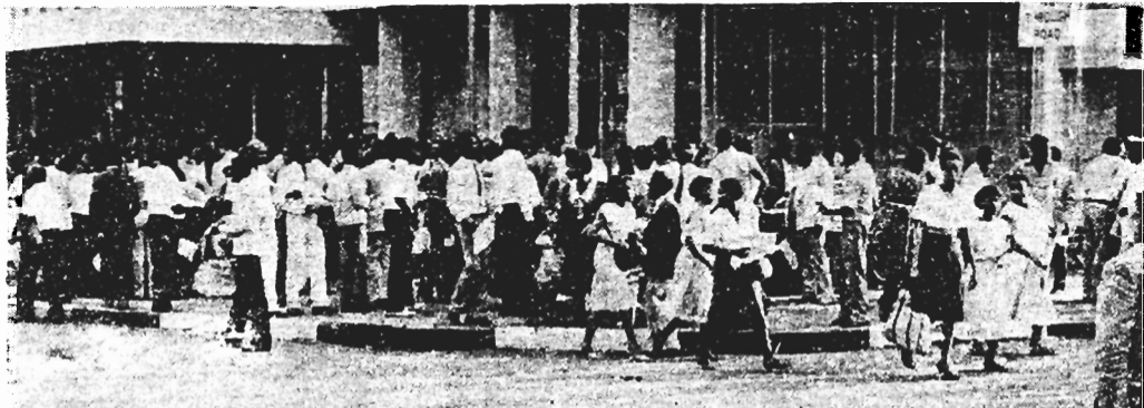
THE HERALD published a special edition yesterday afternoon and thousands clogged the pavements — queuing in most cases, fighting in a few — to buy a copy. Rush-hour traffic was even worse than usual in Second Street with long queues of cars trying to turn into Gordon Avenue and, in some cases, just stopping

"Zimbabwe," said Cde Muzenda, "pays homage to this illustrious son of Africa and at the same time calls upon the fraternal people of Mozambique to continue the wide-ranging struggle that he had so ably led."