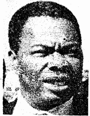
REAR-ADMIRAL Aikhomu soon after his arrival at Harare Airport yesterday on a stop-over on his way to Maputo for Cde Machel's funeral today.

rived yesterday were the chairman of the Organisation of African Unity