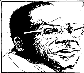
Prime Minister Robert Mugabe

In mid-September, Kaunda, Machel and Zimbabwe Prime Minister Robert Mugabe visited Malawi to read the riot act to President Kamuzu Banda over his continued support for the South African-backed Mozambique national resistance forces (Renamo) fighting Mozambique's Frelimo government.